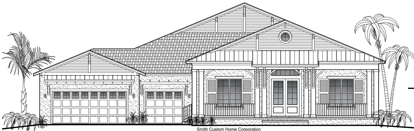
"Islamorada" Caribbean Elevation "B" 3F